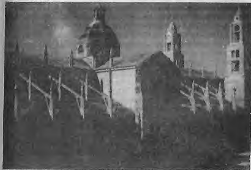
Below: The main cathedral in Chilapa, Guerrero